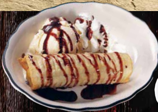
CHIMI CHEESECAKE WITH ICE CREAM

Substitute all red sauce for cheese sauce. add 1.50