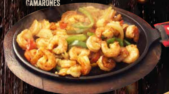
FAJITAS DE CAMARONES