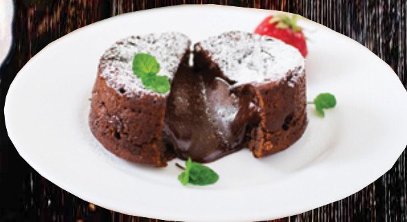
CHOCOLATE LAVA CAKE