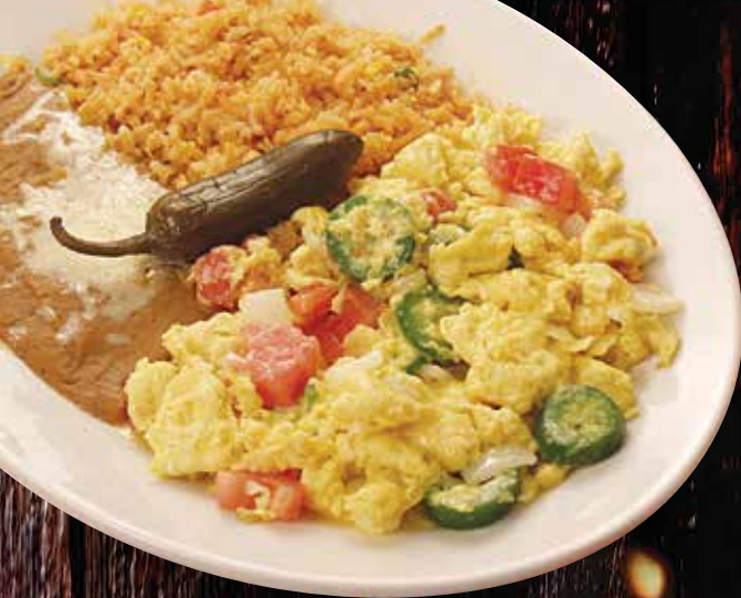
HUEVOS A LA MEXICANA