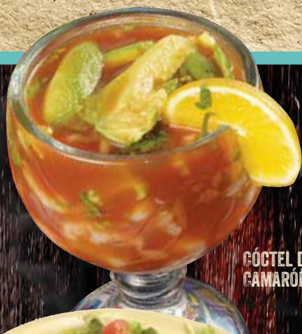
CÓCTEL DE CAMARÓN