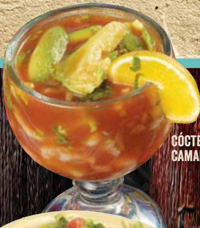
CÓCTEL DE CAMARÓN