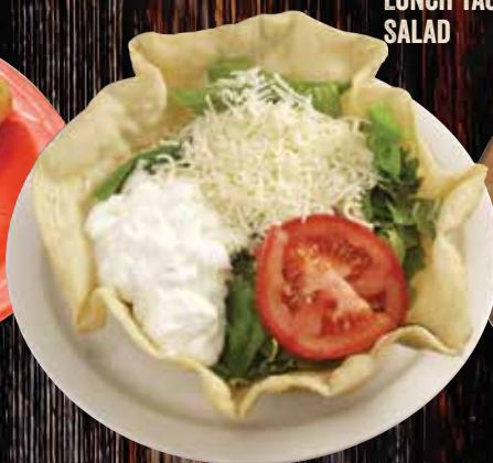
LUNCH TACO SALAD