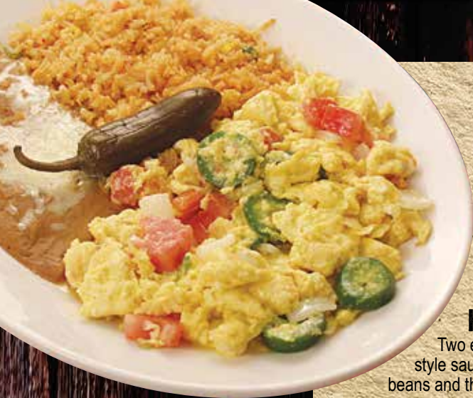
HUEVOS A LA MEXICANA