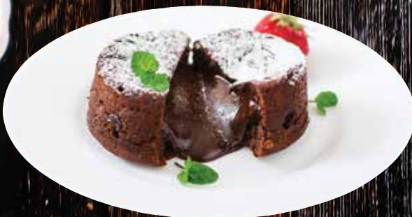
CHOCOLATE LAVA CAKE