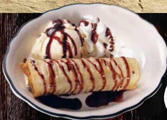
CHIMI CHEESECAKE WITH ICE CREAM

Substitute all red Sauce for cheese Sauce. add 1.99